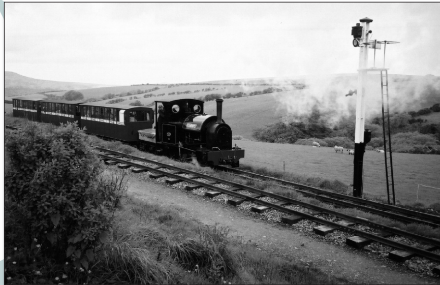
On 12 May 2007 0-4-2ST 'STANHOPE' (KS 2395/1917) climbs the bank on the approach to Woody Bay with a train from Killington Lane. The siding to the approach drive is climbing in the foreground.

Industrial & Narrow Gauge Railways - Devon