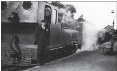
In the early 1920s 2-4-2T 'YED' (MW 1367/1897) waits to depart from Lynon.