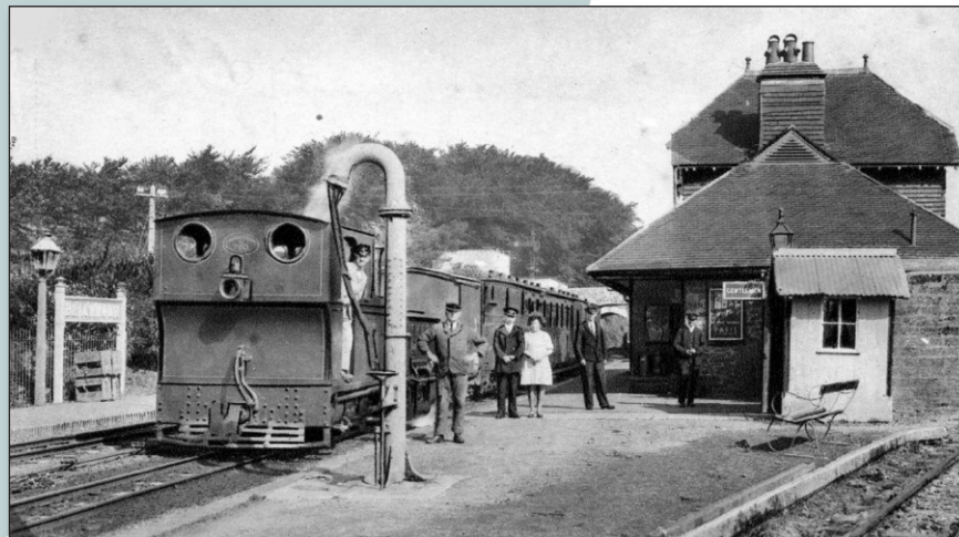
In the early 1930s 2-6-2T E761 'TAW' (MW 1363/1897) waits at Blackmoor station with a mixed train to Barnstaple Town. The building with an extension added is now the Old Station House Inn.