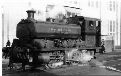
Above: On 26 January 1963 0-4-0ST No.18 (AB 2137/1942) moves around North Yard near St Leven Gate. This loco was also sold to a dealer and was scrapped during 1968.