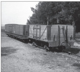
Empty and loaded wagons stand in the loop at Woody Bay Station in the early 1920s.