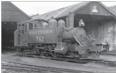
In SR livery 2-4-2T E762 'LYN' (BLW 15965/1898) is at Pilton Yard in the early 1930s.